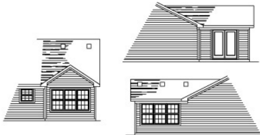
Optional Sunroom Partial Side/Rear Elevation